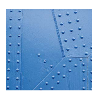
Here you find animations and videos on our MixCoat™ systems.